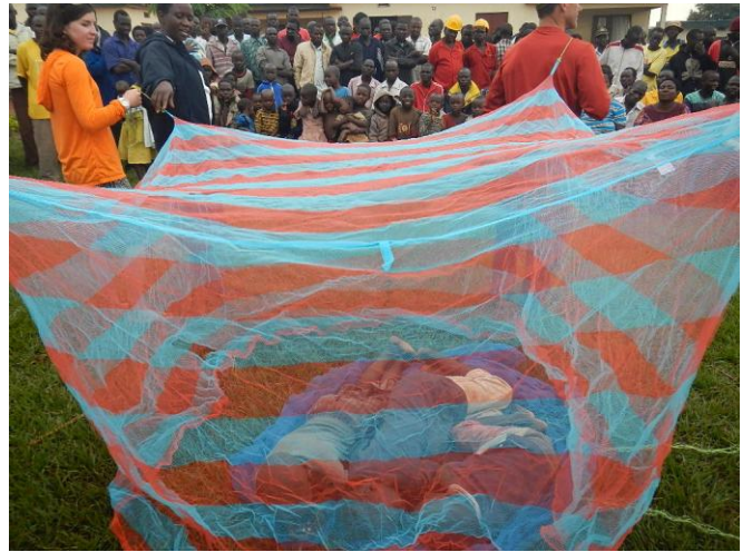
The very popular striped nets at a malaria education session and net sale.