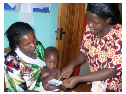
Malaria treatment with Coartem.

Last December, Soft Power Health introduced its new striped nets into the field and the response was extremely positive. People really like the brightly colored stripes! In fact, the reaction has been so good that we now have dedicated net sales selling either the new striped nets or the original plain blue ones. Kudos to BestNet, the mosquito net manufacturer, who realized that stripes would make the nets more appealing.