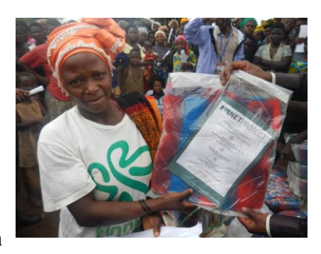
Congolese refugee appreciating her new long lasting insecticide treated net at malaria education session and net sale at the Kyaka II refugee camp.

Despite the fact that the ministry of health in Uganda gave away 15,500,000 free mosquito nets in Uganda this year, Soft Power Health was still able to fill in many gaps that the government missed, including a big trip to a refugee camp in Western Uganda in December 2013. This year Soft Power Health sold 8,368 mosquito nets across 62 villages in Uganda. In addition, the Soft Power Health malaria team made 1,125 follow up visits to net buyers' homes to assess net usage and malaria incidence. All of this was accomplished despite having free nets being distributed nearly everywhere in Uganda. Luckily, we are still able to address the needs of people who these government programs miss and who are still interested in truly adopting a behavior change of sleeping under an LLIN every night.