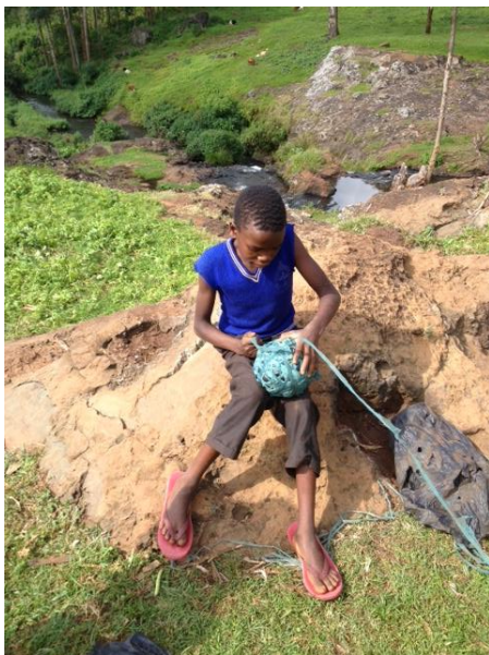
A local boy uses a government-issued free mosquito net to make a soccer ball.

For the past 8 summers, we have hosted Mt. Sinai Global Health students and residents. Each year the visiting students help us work on a particular public health problem facing the clinic or our outreach programs. This year our Mount Sinai student was joined by a Columbia University Global Health student and together they undertook a mosquito net usage survey in our home sub-county of Budondo. The survey's purpose was to discover how many families are using their mosquito nets correctly. In the wake of the Ugandan government's mass free net distribution in 2013-2014, mosquito net misuse has become a widespread problem in Uganda. We want to track how many families in our home village, and the surrounding villages in our area, are using their nets correctly, as this information will help us to tailor our malaria outreach programs to be more effective.