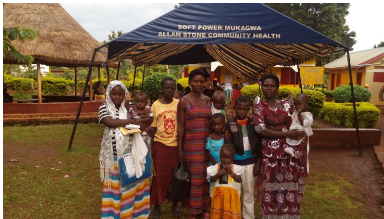
Community patients from Kirindi visit the Clinic.