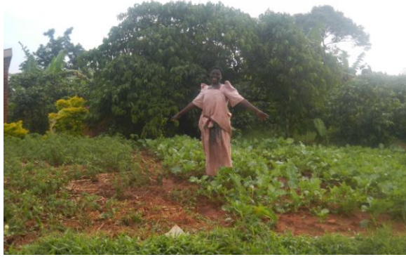
A proud Super Hole village farmer with her DIG garden.

Kayunga district. Over the next year, we hope to see an improvement in nutrition, health, and quality of life for the people as a result of the proliferation of DIG gardens.