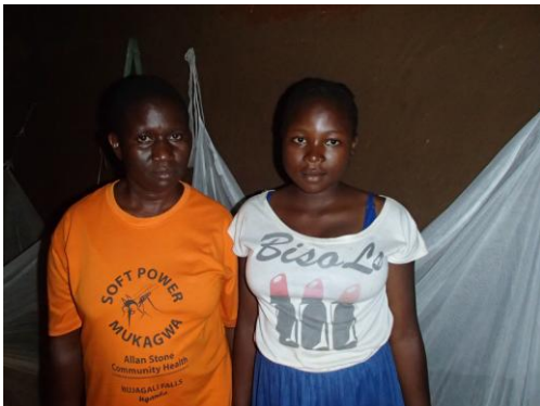
Home visit to young mother-to-be. Her mosquito net is hanging well!