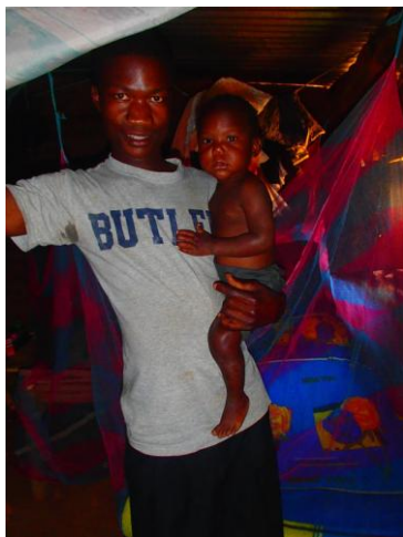
A young father and his child with their mosquito net hung correctly.

This quarter, we sold a total of 2,015 mosquito nets through our malaria education and prevention outreaches in 14 villages in Jinja, Mayuge, and Kayunga districts and at the clinic. 539 people attended our malaria outreach education sessions. Specifically, 650 nets were sold at the clinic while 1,364 nets were sold during our malaria education outreach sessions. In addition, the malaria outreach team made 264 follow-up visits in 13 villages to evaluate whether previously purchased nets from education sessions were being used correctly and whether people reported having less malaria.