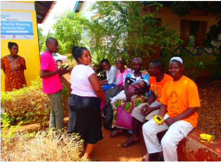
Counseling about family planning methods during Marie Stopes collaborative day.

This quarter's family planning outreach programs continue to be well attended (1053 attendees), by both men and women. These outreaches remain a much-needed reliable service to local communities. This quarter, 983 women received three-month birth control injections for intermediate-term family planning. 34 women chose birth control pills during outreach sessions. Also this quarter, 36 new long-term contraceptive implants were placed. 322 women requested and received pregnancy tests. In addition, 22 women requested and received counseling about side effects of birth control. 11,621 male condoms and 290 female condoms were distributed at family planning outreach sessions. Finally, we are very grateful to