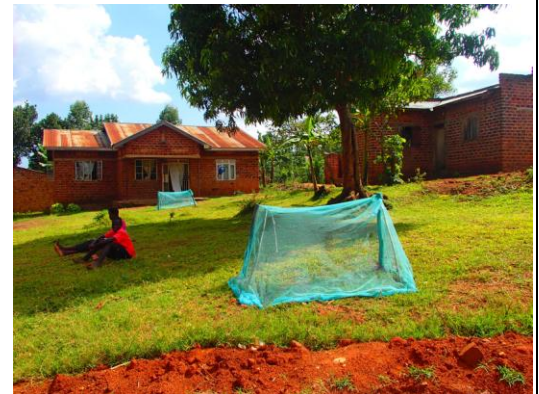
Mosquito nets improperly used as football goals.

During the current campaign, a collaborative effort to "eliminate" malaria undertaken by the Ministry of Health, the WHO, the UN, and the Global Fund for AIDS, TB & Malaria, 24,000,000 mosquito nets will be distributed all over Uganda. Because of this, we expect our sales of mosquito nets to drop off significantly in the next several quarters, but we plan to continue with our education sessions since there is still a huge gap in understanding how malaria transmission occurs, as well as how to properly use a mosquito net and prevent malaria.