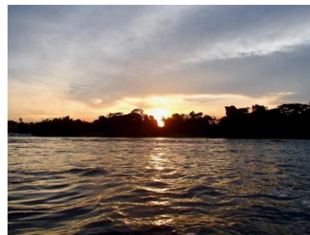
Sunset at Hairy Lemon Island, which will soon be completely flooded due to the Isimba Dam.

In the 2 nd quarter, the DIG team added 6 new gardens, meaning that 6 more local families will soon have the knowledge and capacity to both feed themselves and to have crops left over to sell. This makes a total of 41 ongoing local gardens thanks to DIG! This quarter, the SPH garden produced kale, matoke , cassava, eggplants, sugarcane and pineapples for staff lunches, and also had enough left over to sell. Our garden also produced the ingredients for 9kgs of posho , which was donated to the Matiya and Mirabu community patients.