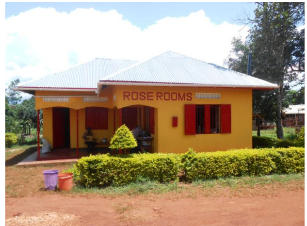
Our just-completed new building, the Rose Rooms, built through the generosity of the Rose Family.

This quarter, 438 rounds of vaccinations were administered. 132 women received intermediate term family planning methods: 126 three-month courses of Depo-Provera injectable birth control were administered, and 3 three-month packages of birth control pills were distributed. Also, 44 long-term implants were placed and 11 were removed, making for a total of 176 women who received intermediate or long term family planning methods at the wellness center this quarter. Finally, 288 male condoms and no female condoms were distributed from the Wellness Center. During this quarter, 3,548 people were tested for HIV, with only 87 positive results. This represents an extremely low 2.5% positivity rate. 79 pregnancy tests were taken, and 2 were positive. This quarter no women requested counseling about birth control side effects.