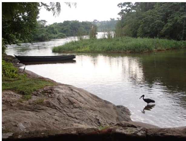
Morning at Hairy Lemon Island, which will soon be underwater.