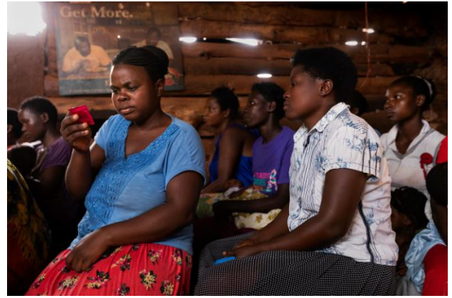
A woman reads a condom packet during a family planning outreach session.

A new DIG outreach schedule will start at the beginning of August 2019 and will continue until the beginning of February 2020. This outreach will include 30 new gardens! The crops planned include maize, beans, peanuts, and kale. In addition, food security/community contributions members will contribute cassava stems, potato vines, banana suckers, and yams.