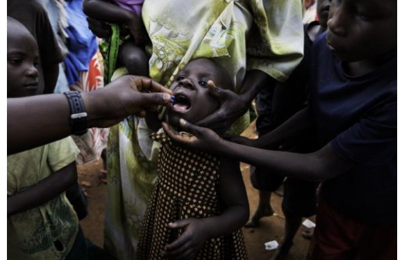
A young child receiving vitamin A supplementation after a malnutrition outreach session.

At the Mother and Child Wellness Center, 185 women received intermediate term and long term family planning methods: 117 three-month courses of Depo-Provera injectable birth control were administered and 10 three-month packages of birth control pills were distributed to women who chose these forms of family planning. 30 long-term implants were placed and 13 were removed. 9 IUDs were placed and 1,001 male condoms were also distributed. Between the Mother and Child Wellness Center and outreach, 1,538 women received intermediate and long term family planning. With the ongoing countrywide shortages of family planning supplies, these are fabulous achievements by the family planning teams.