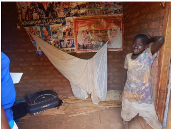
A young community patient shows off his bed and correctly-hung mosquito net, during a follow-up visit.

This quarter, 590 people in 26 villages in 11 sub-counties in 3 districts attended our malaria outreach education sessions. In addition, between the Clinic and our malaria education outreaches, we sold 606 nets. Specifically, 107 nets were sold during educational outreach sessions while 499 nets were sold at the Clinic. The malaria outreach team made 45 follow-up visits in 11 villages in Jinja, Mayuga, Iganga, and Kayunga districts to evaluate whether previously purchased nets from education sessions were being used correctly and whether people reported having less malaria. It is a sad fact that this quarter malaria treatment rates rose again at the Clinic. Without vigilant monitoring and making education and prevention methods available to all who need it, it is possible that malaria will come roaring back to be a bigger problem in Uganda. This is especially true in our area and in large part may be due to Isimba dam.