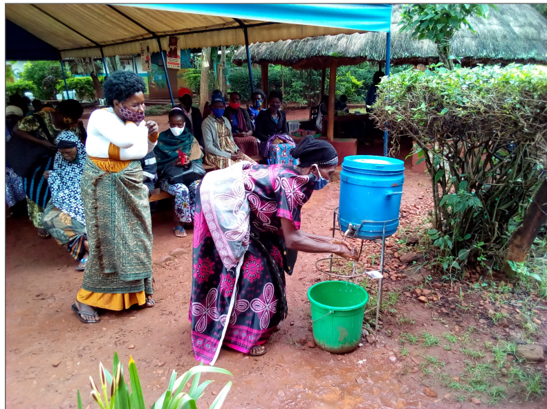
Soft Power clinic staff and patients take precautions against Covid-19.