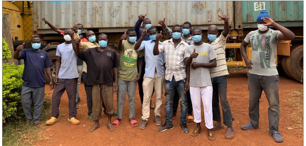
Special Delivery of Mosquito Nets arrives at the clinic.