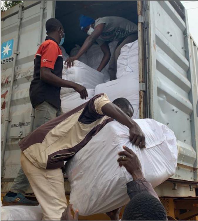
Bales of mosquito nets are unloaded at the clinic.

Still, during the third quarter we sold 1,300 mosquito nets. Our largest quarterly sales in several years! As malaria was the most common disease we treated during early lockdown, we've been thrilled to provide preventative measures to communities in need!