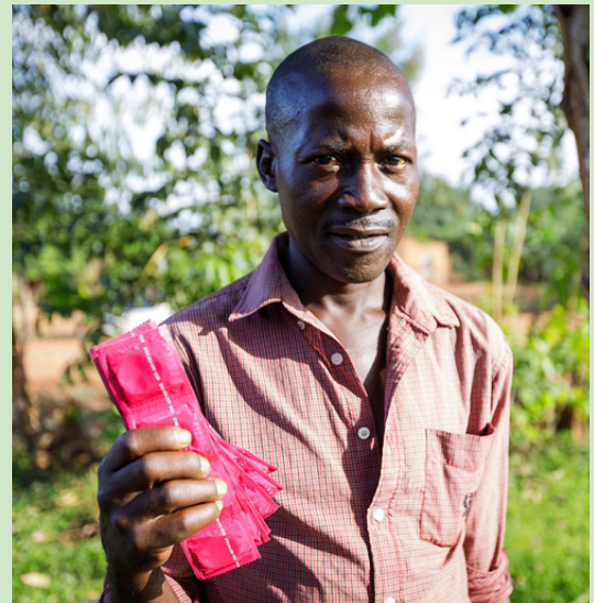
Family Planning outreach client with condoms.