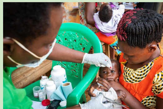
A child receives albendazole during family planning.