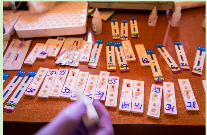
After a doctor's consultation, patients head to the lab for any needed tests. Once tests are ready, the patients return to the doctor's office to conclude and receive prescriptions which are dispensed by nurses at the pharmacy.