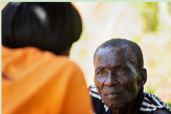
Domestic violence interventions are an essential part of comprehensive health care.