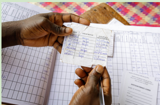
Denis records injections at a family planning outreach.

14,958 deworming treatments for hookworm with albendazole were provided in 2021.