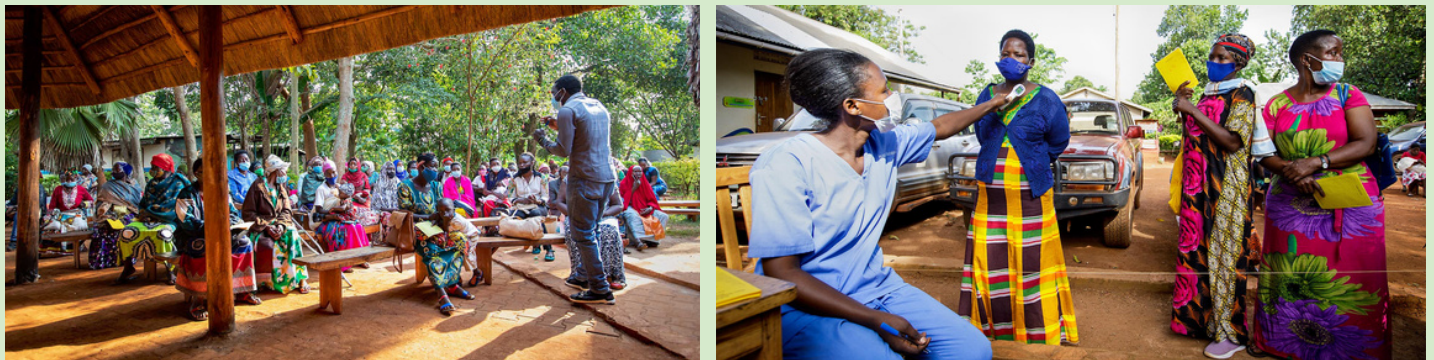
Every day the SPH staff conducts a comprehensive orientation providing information regarding clinic procedures and our outreach programs. Following the presentation, every patient is triaged with their temperature taken and vital signs recorded.