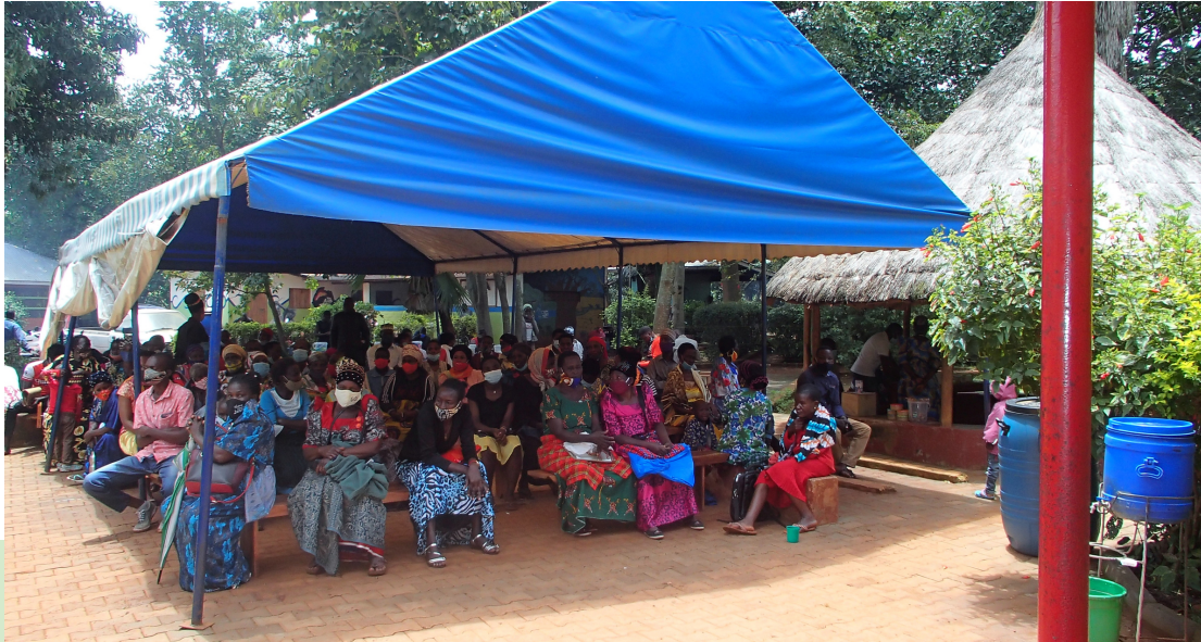
Patients waiting on a busy Monday morning at the clinic. Patient numbers are back to pre-pandemic range.

Through healthcare service to people in need, we take a step towards making a more just world