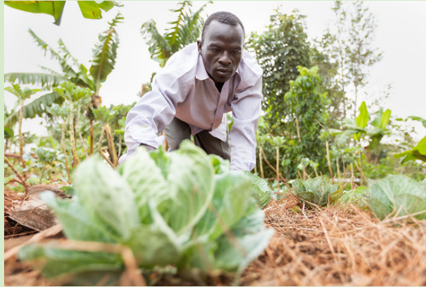
Weeding the SPH clinic home garden.

The home garden thrived during the third quarter while outreaches were suspended. Bounty from the garden supplied the lunchtime meal for SPH, extra food for community patients, and income generation.