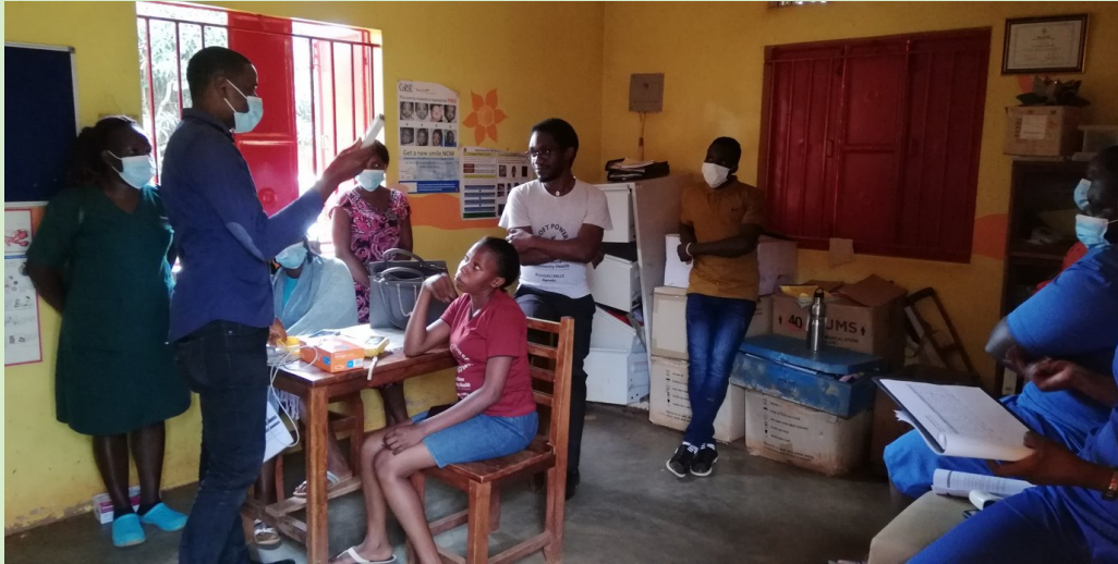
Continuing medical education at the clinic.