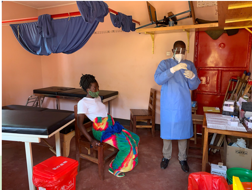
The new Covid-19 ward in action.

Through healthcare service to people in need, we take a step towards making a more just world