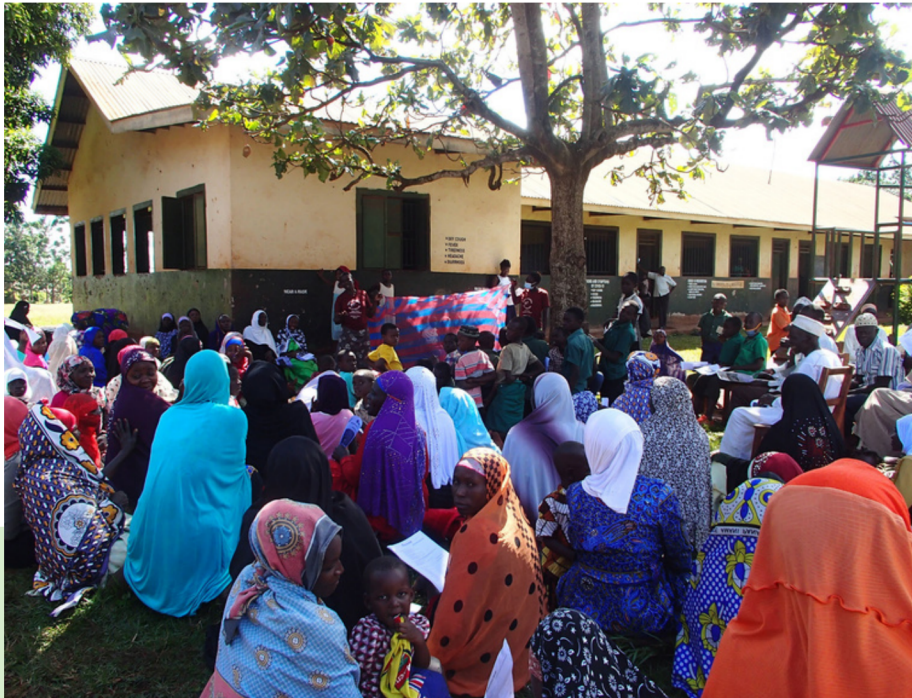
A very well attended malaria education session prior to second lockdown.

Through healthcare service to people in need, we take a step towards making a more just world