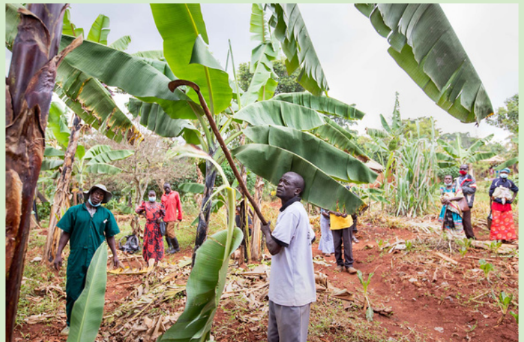
The week-long seminar included proper pruning of matoke plants.

Over 5 days at the clinic, these outreach gardeners SPH supports attended interactive lectures and in-garden hands on sessions to soak up as much learning as they could. The week was a huge success.