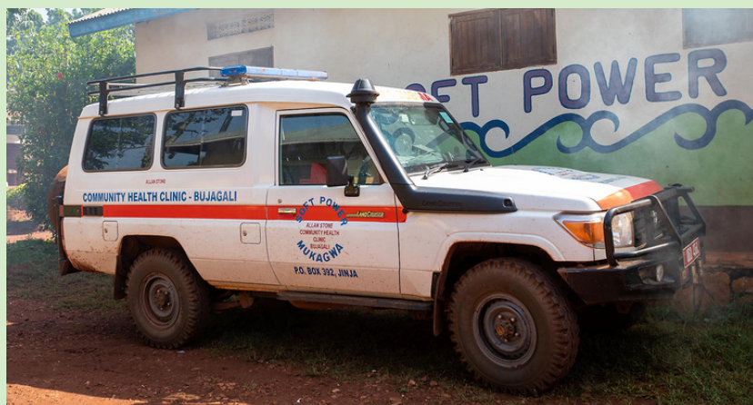
The new "Bruiser" Cruiser, a converted ambulance!

Thanks to successful fundraising efforts from Giving Tuesday and Soft Power Health's 2021 newsletter, we were able to purchase a good condition used Land Cruiser to offload a major burden of transport needs for SPH. The cruiser was a former ambulance which we converted to an all-use vehicle to transport staff, patients, medicines, lab supplies, and to handle any emergencies SPH may have. We can now continue uninterrupted service for the running of the clinic and outreaches. Thank you very much to everyone who contributed to make this possible!