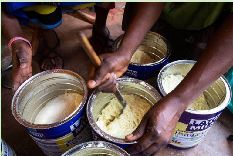
HEM is prepared at the SPH kitchen for patients to administer at home.