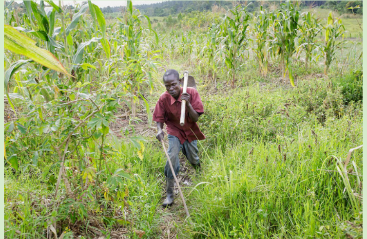
Returning home after spending the morning working in his garden.