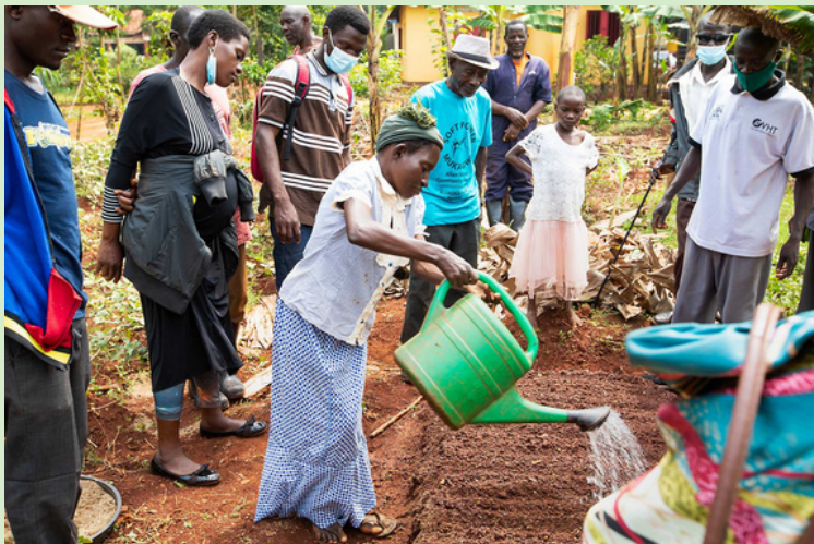
Freshly planted seeds are watered in.