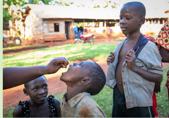
Vitamin A administration in the field.