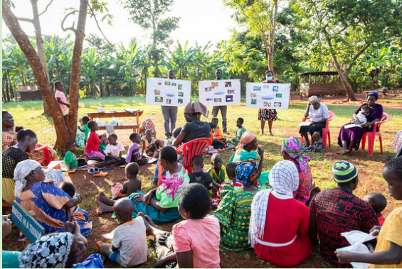
A true team effort during malnutrition education outreach in Kabowa.