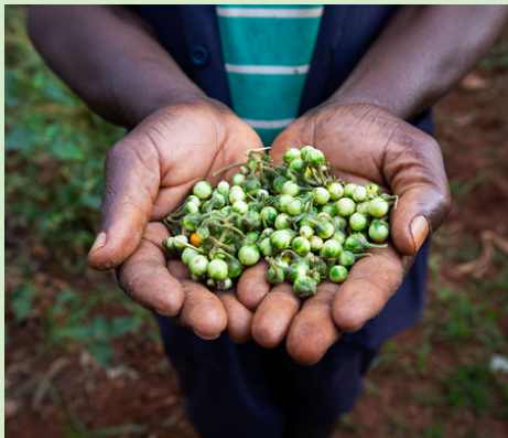
Tiny eggplant morning harvest.