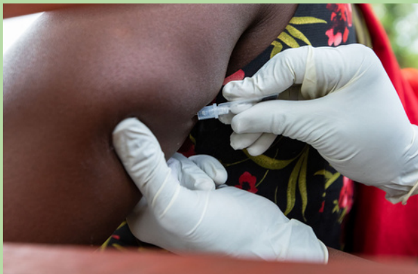
Sayana Press injectable long-term contraception administered during FP outreach.