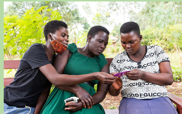
Condoms invite closer scrutiny by attendees at FP outreach in Kyomya.