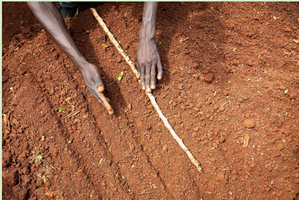
The importance of well organized seed placement was emphasized .