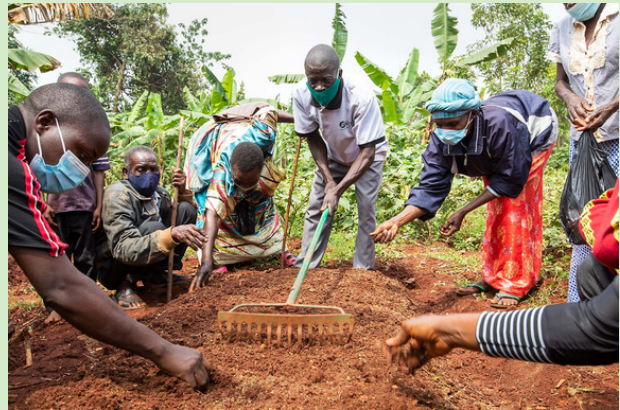
Attendees prepared and inspected a new garden bed.