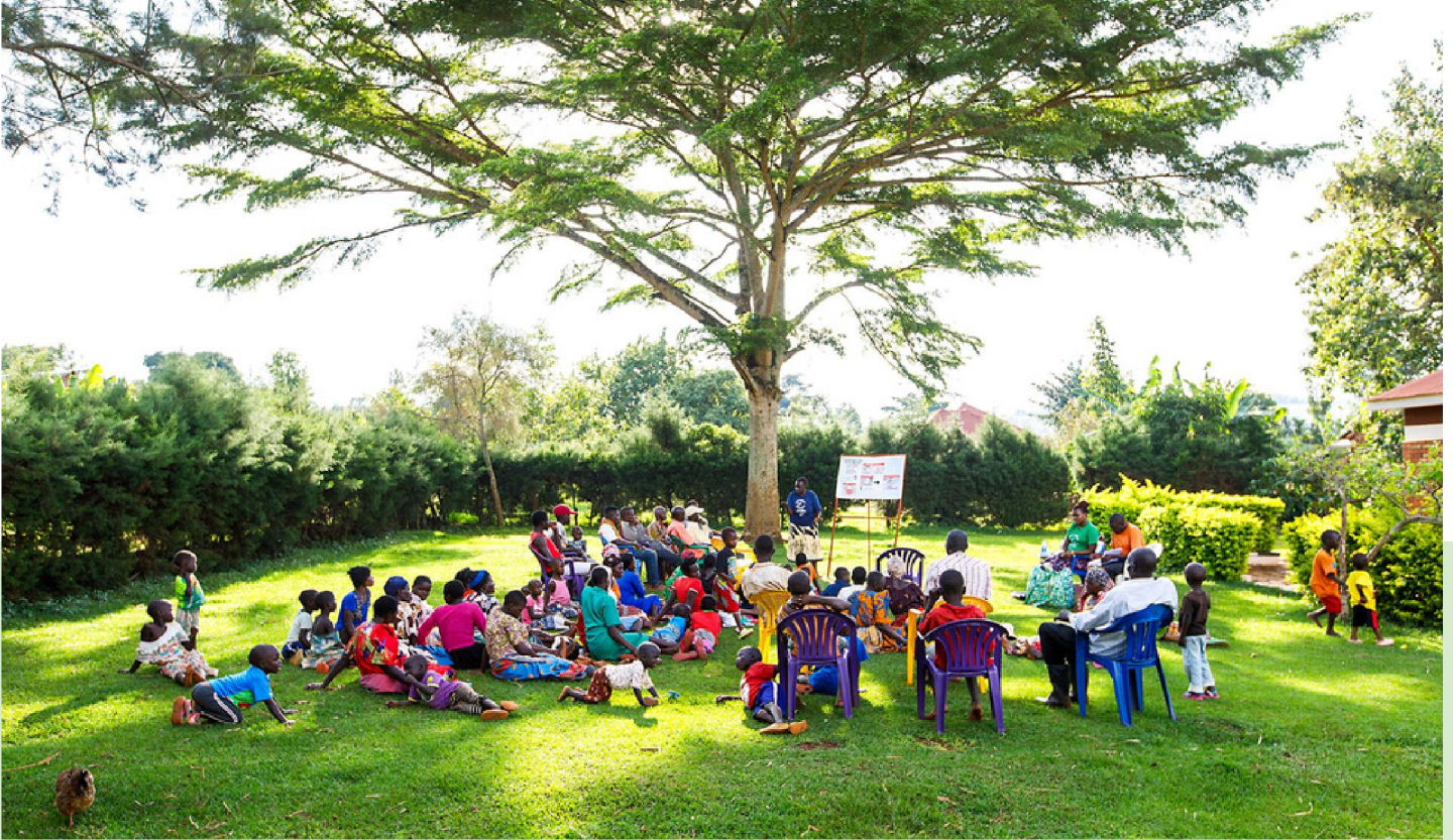
Nurse Annet educating at a malnutrition outreach education session.

Through healthcare service to people in need, we take a step towards making a more just world