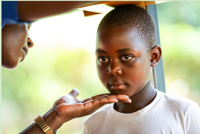
Children have their height and weight measured and recorded at every clinic check up.

Pediatric patients triaged: 1,302 = 14% of all clinic patients.