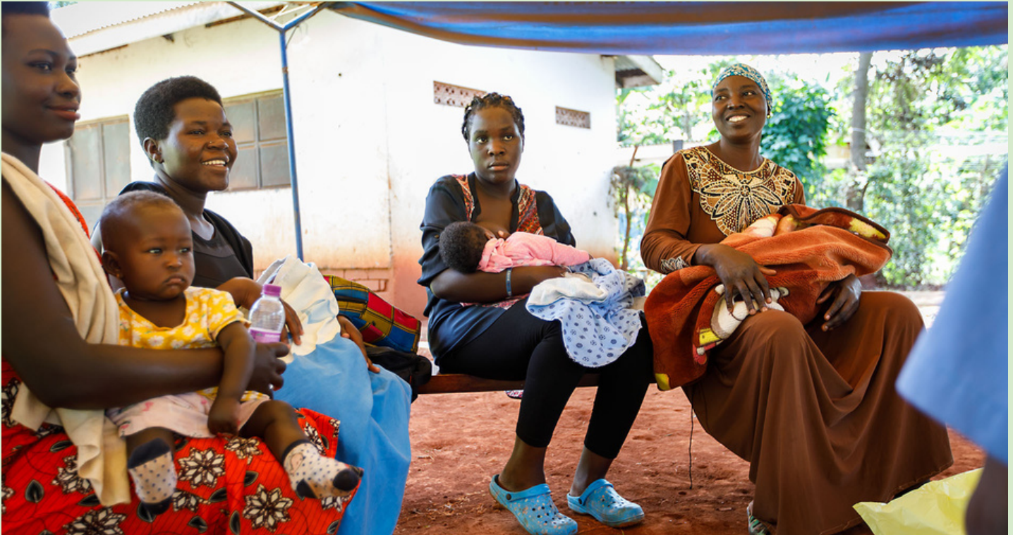
New mother's with their baby's at the clinics Friday vaccination days.

Vaccinations = 33 rounds of childhood immunizations administered.