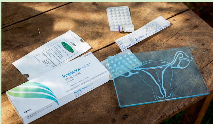
Hands on educational pieces being readied for use at an outreach session.

6,192 condoms distributed between clinic and outreach.