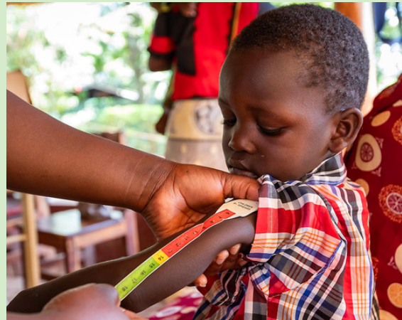
A young patient having his nutritional status assessed at triage.

New pediatric patients: 798 = 61% and returning pediatric patients: 504 = 39%