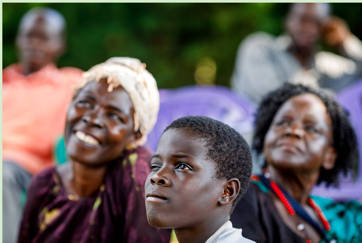
Attendee's learn how to create a nutritious meal and identify signs of malnutrition.