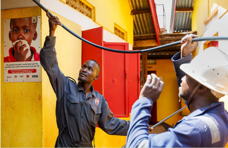
High speed coax cable being installed at the clinic.

Soft Power Health has been brought into the computerized modern world.