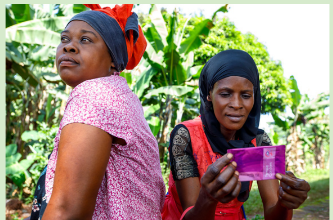
A family planning outreach attendee examines a female condom.