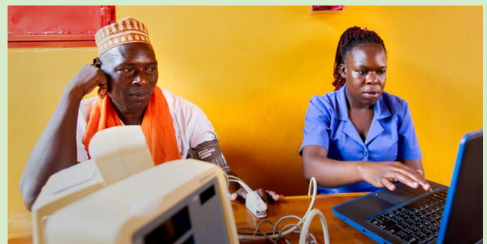
Nurse Gonza records vital statistics at triage.