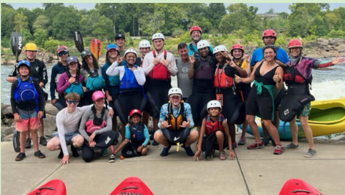
Kids kayak crew in Columbus, Georgia celebrates after a week on the water.