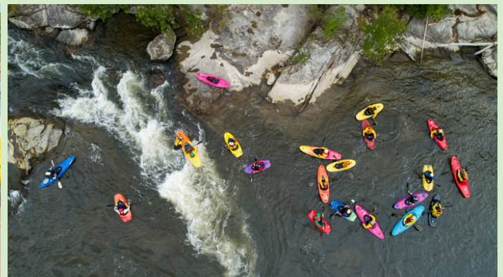
With Green Chimneys we paddled the Housatonic River.