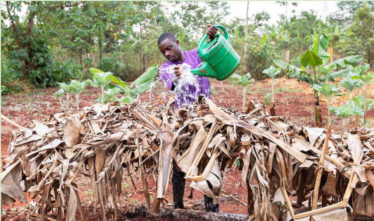
Living at work in the SPH garden in 2013.

Thank you Living for helping us achieve our electronic medical record dream!