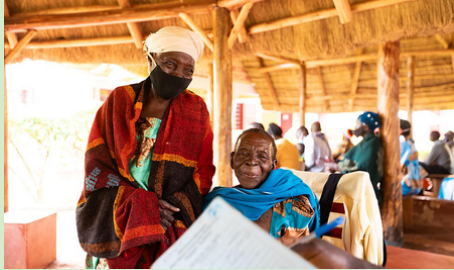
Patients register at the clinic.

In 2023, Soft Power Health will treat over 36,000 patients at the clinic. 65% percent of these patients are women. Through health education outreach programs for malaria, family planning, malnutrition, physical therapy, domestic violence and organic gardening, another 20,000 people receive direct help. With medical services reaching over 55,000 people, Soft Power Health is one of the top deliverers of healthcare in Uganda.