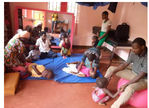
The refurbished physio room being put to good use