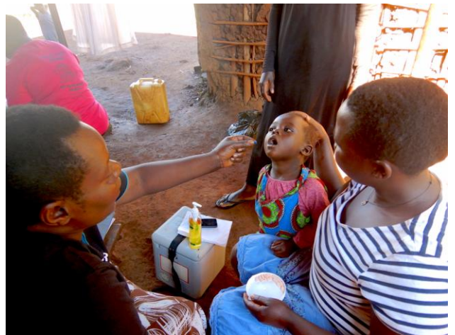
Deworming in action!

1,652 families were reached and assisted with malnutrition education, follow up visits, and interventions in 2019. The malnutrition education team reached 46 villages throughout Jinja, Mayuge, Kayunga, and Iganga districts. 3,645 doses of Albendazole were administered to treat people infected with hookworm, which is a significant contributor to anemia in Uganda (malaria is the major contributor to anemia!) In addition, 2,211 doses of Vitamin A were given to children in need, and 16,380 doses of prenatal vitamins were provided to women in need during the outreach and follow up sessions. This essential education and prevention is helping more families than ever, especially those in severe poverty with limited access to health education and basic treatment. Vitamin Angels continues to donate Albendazole, Vitamin A, and prenatal vitamins to support these vulnerable and in-need populations. Thank you Vitamin Angels!