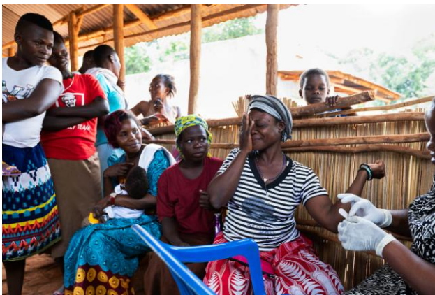
Administration of family planning methods at an outreach

In 2019, between the Clinic, the Mother and Child Wellness Center, and our ongoing quarterly outreaches in 38 villages, Soft Power Health provided intermediate, long-term, or permanent methods of family planning to 5,021 women. 4,197 of those women received family planning in the field through the ongoing community outreach programs. Birth control pills, injections of Depo-Provera, and the placement of birth control implants are available during outreach programs. This year, we distributed a total of 12,745 male condoms between the Clinic and outreach, the vast majority being in outreach.