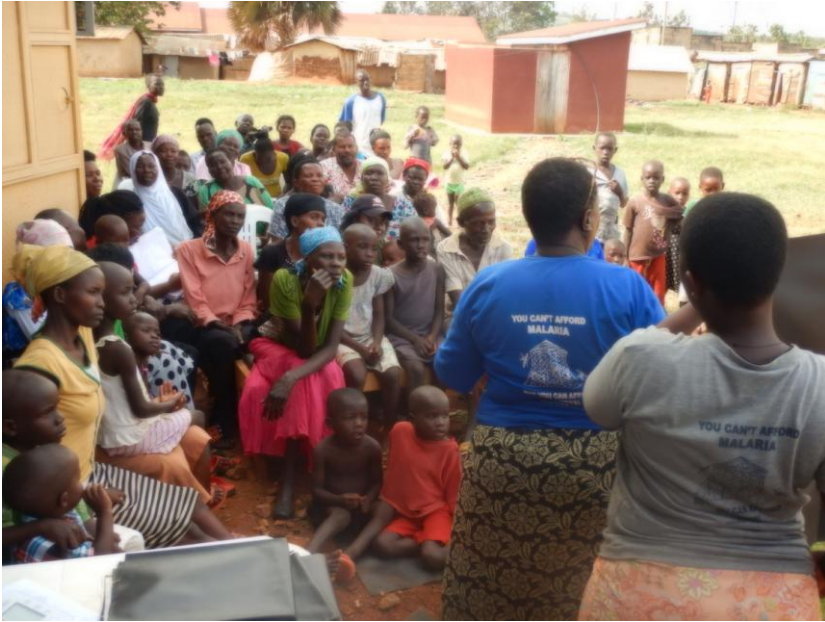
Malnutrition education session at Mama Joy, Njeru.

Between January and March, 256 courses of high energy milk were prescribed to 148 severely malnourished patients, mostly children. In some instances, the patient's malnutrition was severe enough to require several courses of HEM. A portion of the severely malnourished patients we treat have cerebral palsy, muscular dystrophy