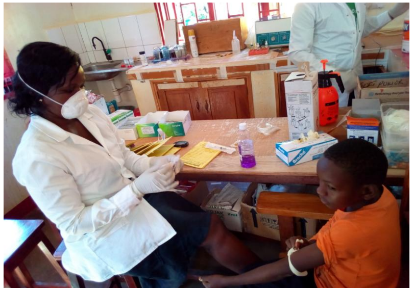
Taking extra precautions at the lab.