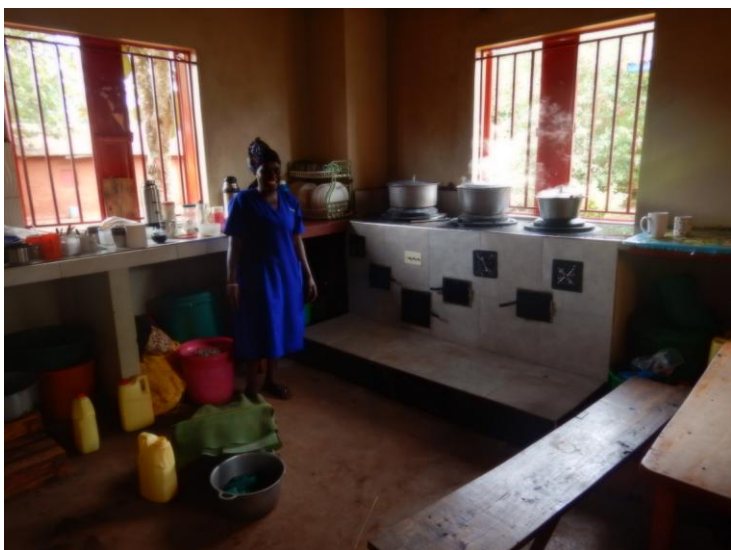
Cook Irene showing off the new fuel-efficient stove in the Clinic kitchen.

Thank you very much for your ongoing support!