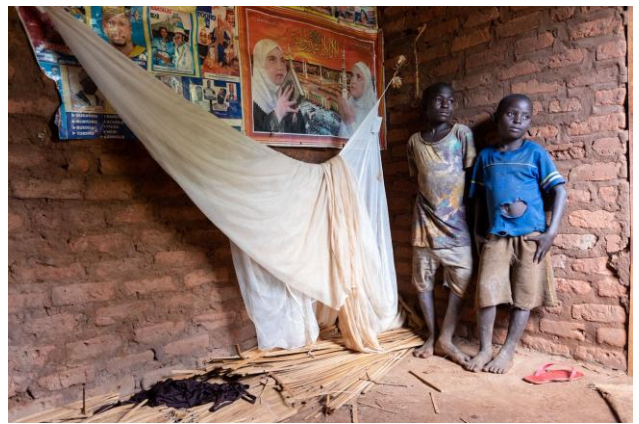
Local children show their mosquito net during a malaria outreach follow-up visit.

This quarter, 461 people in 19 villages in 4 districts including our home district of Jinja, attended our malaria education and prevention sessions. In addition, between the Clinic and our malaria education outreaches, we sold 779 nets. Specifically, 278 nets were sold during educational outreach sessions while 501 nets were sold at the Clinic. The malaria outreach team made 34 follow-up visits in 7 villages in Jinja, Mayuga, Iganga, and Kayunga districts to evaluate whether previously purchased nets from education sessions were being used correctly and whether people reported having less malaria. We can see that since Isimba Dam flooded the Kalagala Offset Area near us, malaria rates have gone back up to what they were 7 or 8 years ago. The malaria education and prevention program is now more important than ever—especially since we are treating much greater numbers of malaria than we were a year ago in the same patient population!