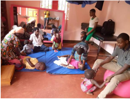
Our newly-refurbished physio-therapy room being put to good use.

abscesses. Dental care, including preventative care, is rare in rural Uganda, so we are glad to offer access to these important health services at the Clinic.